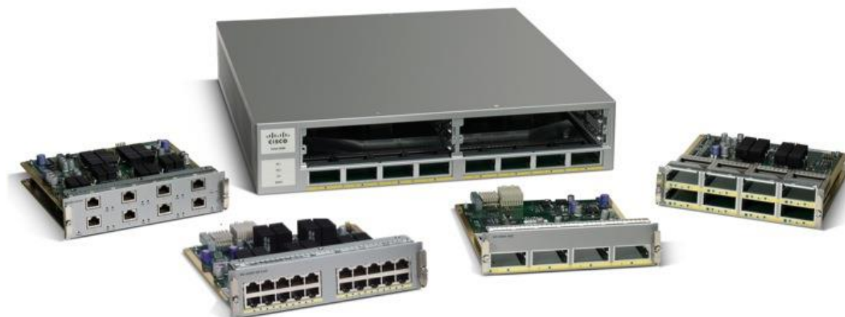
Figure 1. Cisco Catalyst 4900M Switch

The Cisco Catalyst 4900M configuration provides wire-speed connection, buffers to handle bursty traffic, and a comprehensive set of Layer 3 features required at the collapsed core and aggregation layer of the network. The Cisco Catalyst 4900M also supports a suite of ease-of-management features to simplify operations.