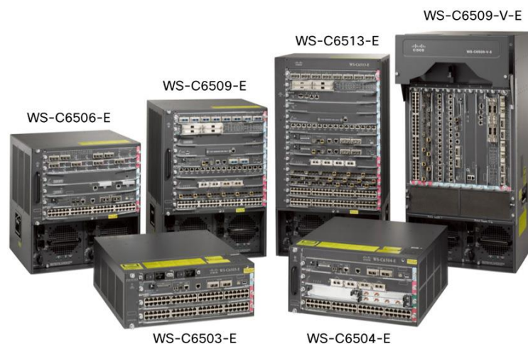
Figure 1. Cisco Catalyst 6500-E Series Chassis

The Cisco Catalyst 6500-E Series Chassis provides superior investment protection by supporting multiple generations of products in the same chassis, lowering the total cost of ownership. The Cisco Catalyst 6500-E Series Chassis (Figure 1) supports all the Cisco Catalyst 6500 Supervisor Engines up to and including the Cisco Catalyst 6500 Series Supervisor Engine 2T, and associated LAN, WAN, and services modules.